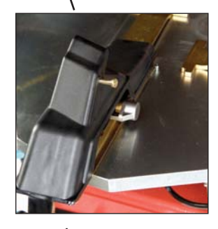
Optional jaw protector covers, part #SM103394 lock into place for extra safety. Protector covers prevent accidental rim damage.