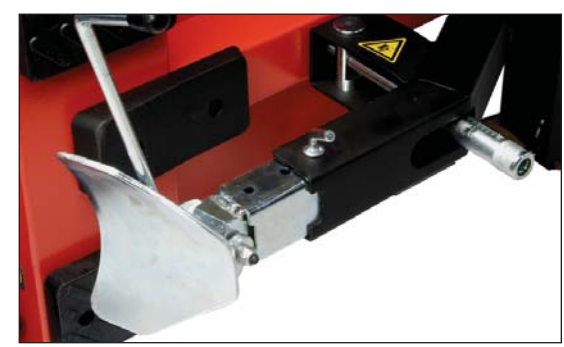
Adjustable 3-position bead-breaker to accommodate large wheel diameters with a telescopic adjustment to increase width capability.