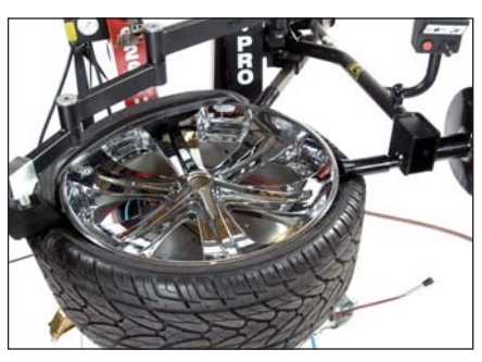
Accu-Pro Mounting Helper shown easily mounting the top bead on 26" rim.