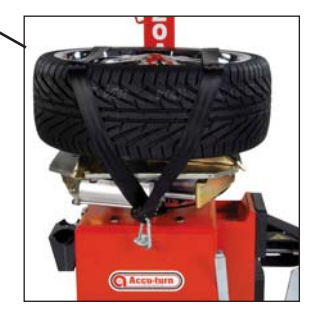
Safety Inflation System secures rim during inflation to prevent operator injury and decrease shop liability.