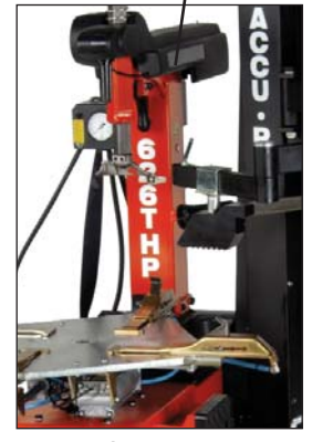
Unique telescoping tower allows for wide rims and produces added strength.