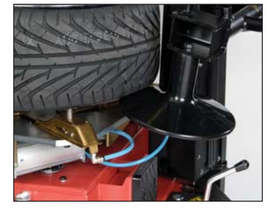
Locking roller disc lifts and removes bottom bead effortlessly and securely.